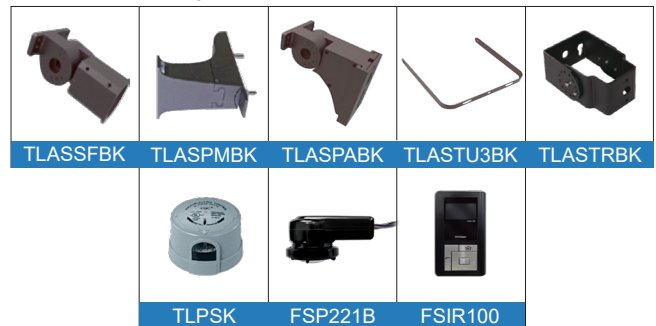
Optional accessories available