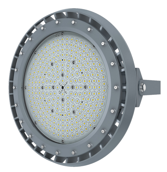
Accessories (not included)