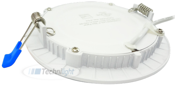
Modèle affiché: WH