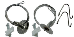
TLSSR Suspension kit