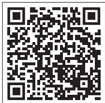
Technilight Smart Google play Android