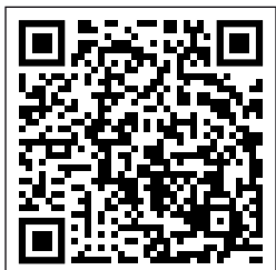
Technilight Smart Google play Android